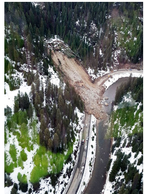
Landslide near Elk City

On February 18, a landslide near Elk City blocked a state highway and sent debris into the South Fork Clearwater River. Our streamgage remains operational.