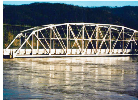
Coeur d'Alene River near Cataldo, February 1996

In mid-February, rain and melting snow swelled rivers throughout northern and central Idaho, including the Coeur d'Alene River near Cataldo . Thankfully, those areas avoided the severe flooding that occurred almost exactly 20 years earlier.